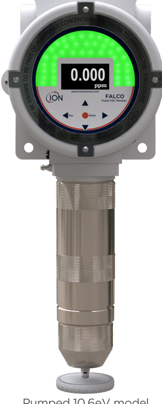
Pumped 10.6eV model

Registering your product online within one month of purchase will extend its warranty.