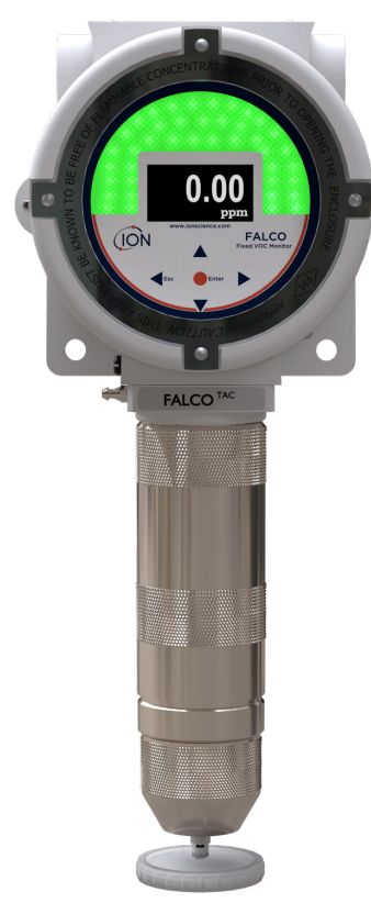
Pumped TAC (10.0eV) model